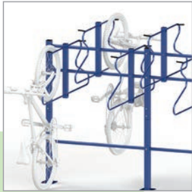
Space Saver Racks & Repair Stations